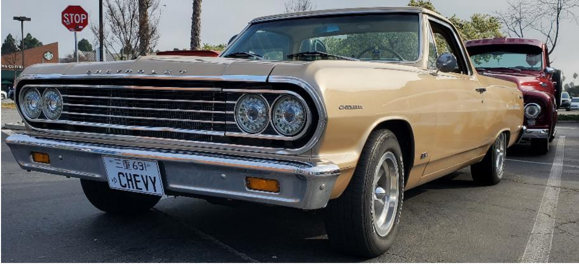
Niles Flying A Cars and Coffee ---- Niles, CA February 8 th , 2026